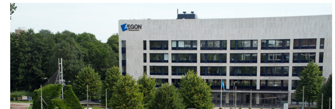
The Hague, the Netherlands