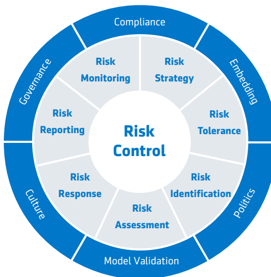
Figure: Building blocks of Enterprise Risk Management framework

BSR’s ERM process can be broken down into multiple components. However, ERM is not strictly a sequential process, where one component affects only the next. It is a multidirectional, iterative process in which almost any component can and does influence another. The principles and requirements of ERM apply on all organizational levels and concern both financial and operational risks. Risks are managed from multiple perspectives, including economic, regulatory and accounting. Relevant metrics in ERM include capital, earnings, liquidity and franchise value.